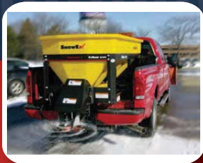
V-BOX IN-BED SPREADERS

NO ENGINES, NO PULLEYS, NO SPROCKETS, NO BELTS, NO CHAINS!