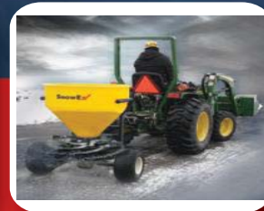
TOW BEHIND SPREADERS