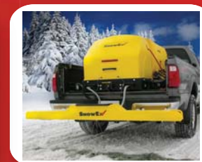
LIQUID DE-ICING SPREADERS