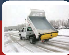
DUMP BOX SPREADERS