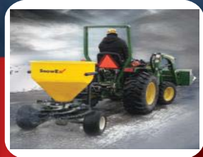
TOW BEHIND SPREADERS