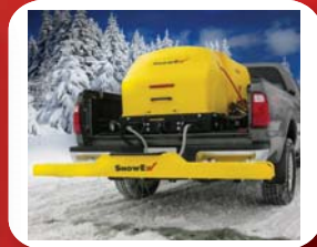
LIQUID DE-ICING SPREADERS