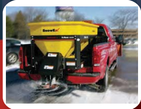
V-BOX IN-BED SPREADERS

NO ENGINES, NO PULLEYS, NO SPROCKETS, NO BELTS, NO CHAINS!