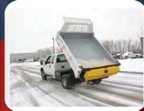
DUMP BOX SPREADERS